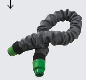
FR Hose Cover Breathing tube not included.