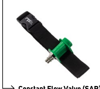
\mapsto Constant Flow Valve (SAR)