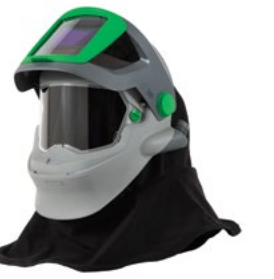
ightarrow FR Shoulder Cape