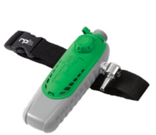
→ C40<sup>™</sup> Climate Control Device (SAR)