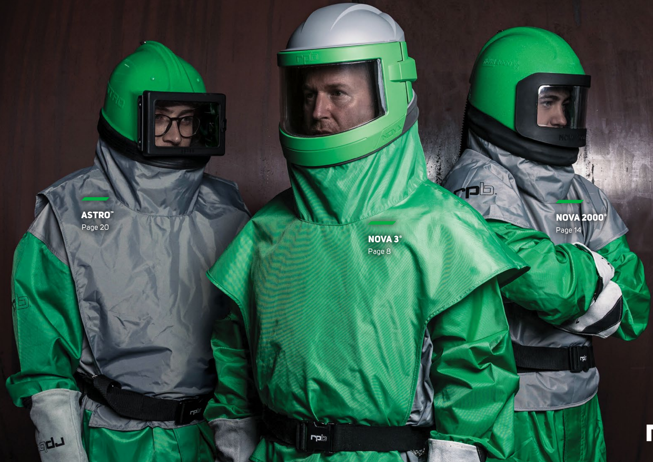
ASTRO™ Page 20