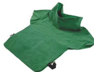
→ Leather Cape