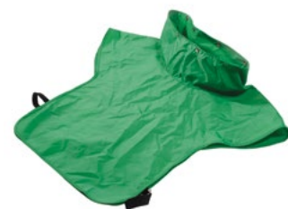
→ Nylon Cape