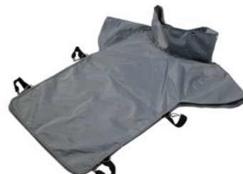
→ Extra Length Nylon Cape