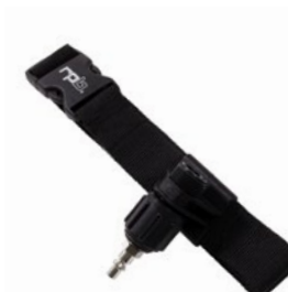
→ Flow Control Valve (SAR)