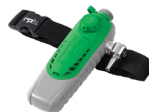
→ C40™ Climate Control Device (SAR)