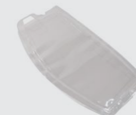
Cassette Lens One outer lens and five tear-off lenses