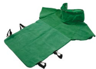
→ Extra Length Leather Cape