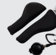
Nova 2000® Talk™ In-helmet communication system