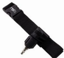
→ Flow Control Valve (SAR)