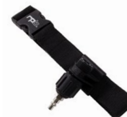
→ Flow Control Valve (SAR)