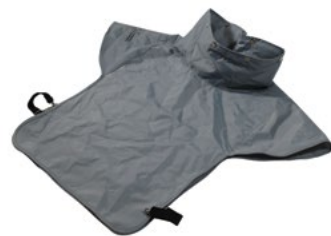
→ Nylon Cape