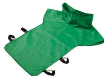
→ Extra Length Nylon Cape