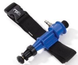
→ Cool Tube Valve (SAR)