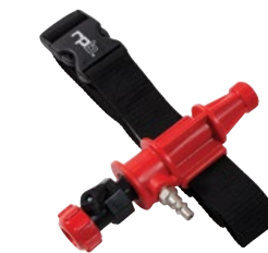
→ Hot Air Tube (SAR)