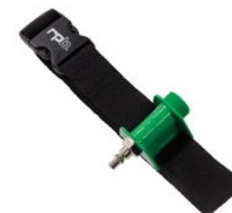
→ Constant Flow Valve (SAR)