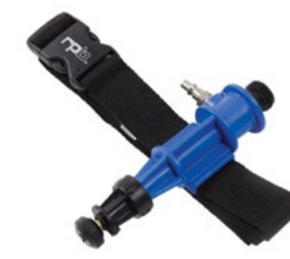
→ Cool Air Tube (SAR)