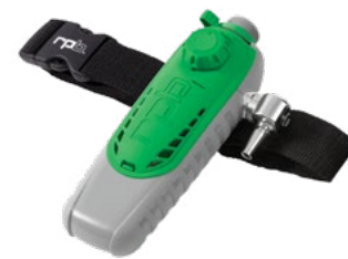
→ C40™ Climate Control Device (SAR)