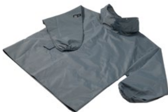
→ Blast Jacket