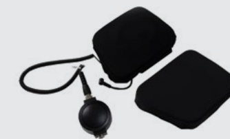
Nova 3® Talk™ In-helmet communication system