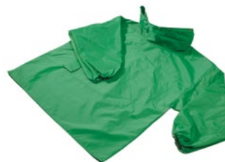
→ Blast Jacket