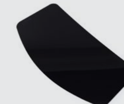
Tinted Inner Lens