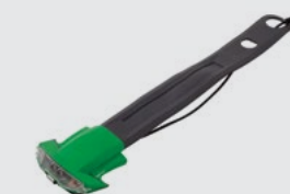
L4™ Light Helmet light