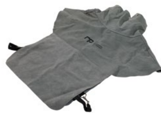
→ Leather Cape