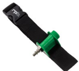
→ Constant Flow Valve (SAR)