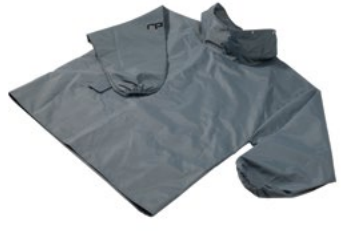
→ Blast Jacket