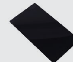
Tinted Inner Lens