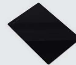
Tinted Inner Lens